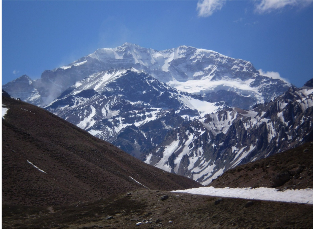
Mt Aconcagua 7,000 m – Argentina (near Base Camp)