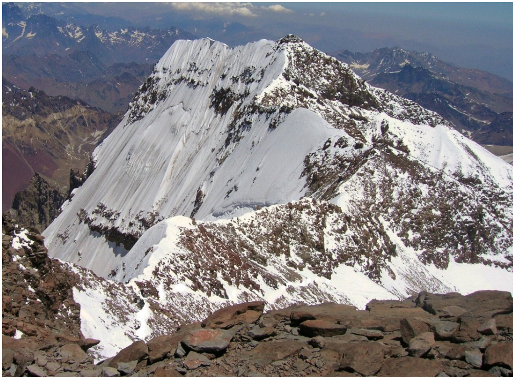
Mt Aconcagua 7,000 m – Argentina (from the Summit)